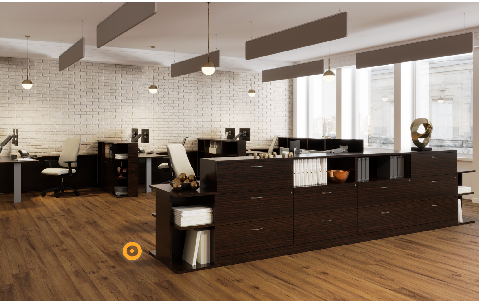
PRODUCTS SHOWN Global Zira and Sora; ezoBord CURV