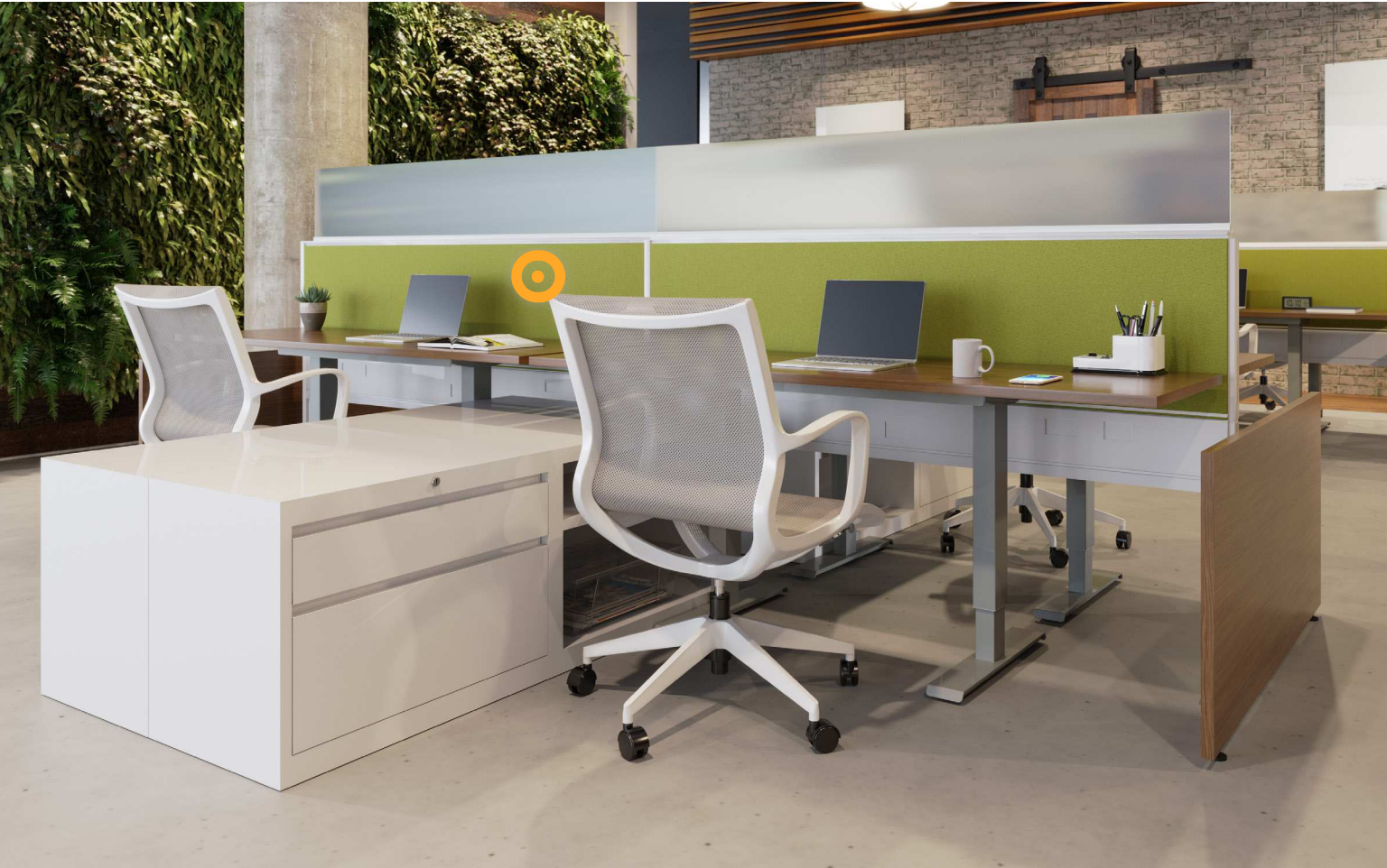
PRODUCTS SHOWN Global Intelli Beam and Solar