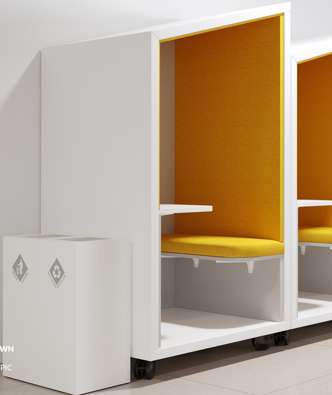
PRODUCTS SHOWN Nook Solo Booth, Magnuson Group PIC